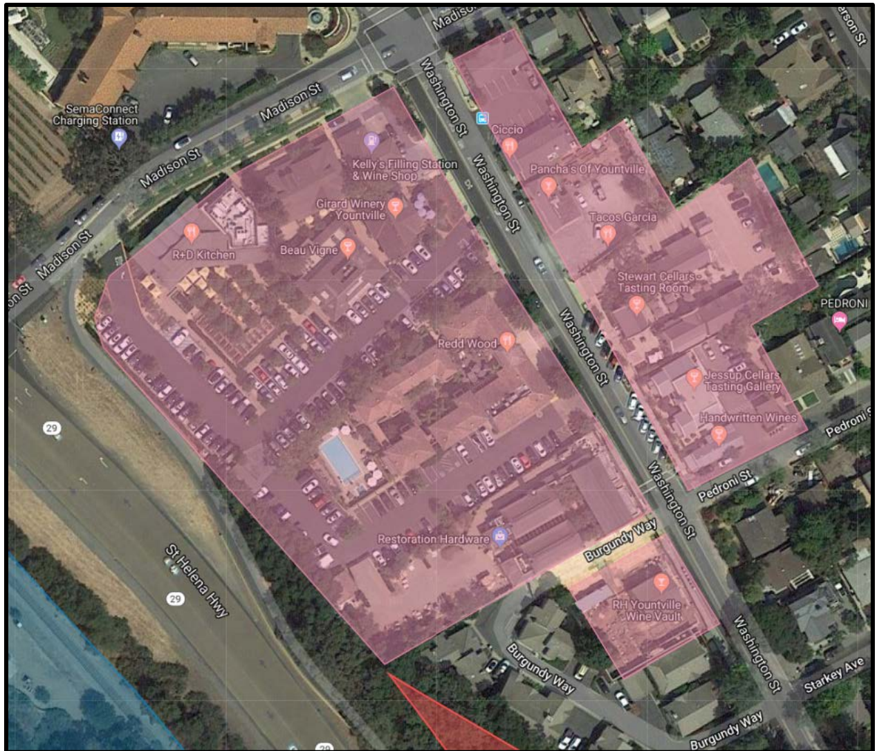
Detail 2: Old Town Commercial